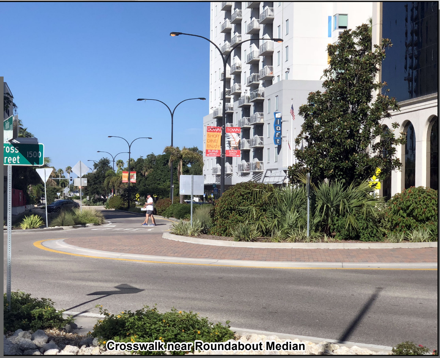
Crosswalk near Roundabout Median