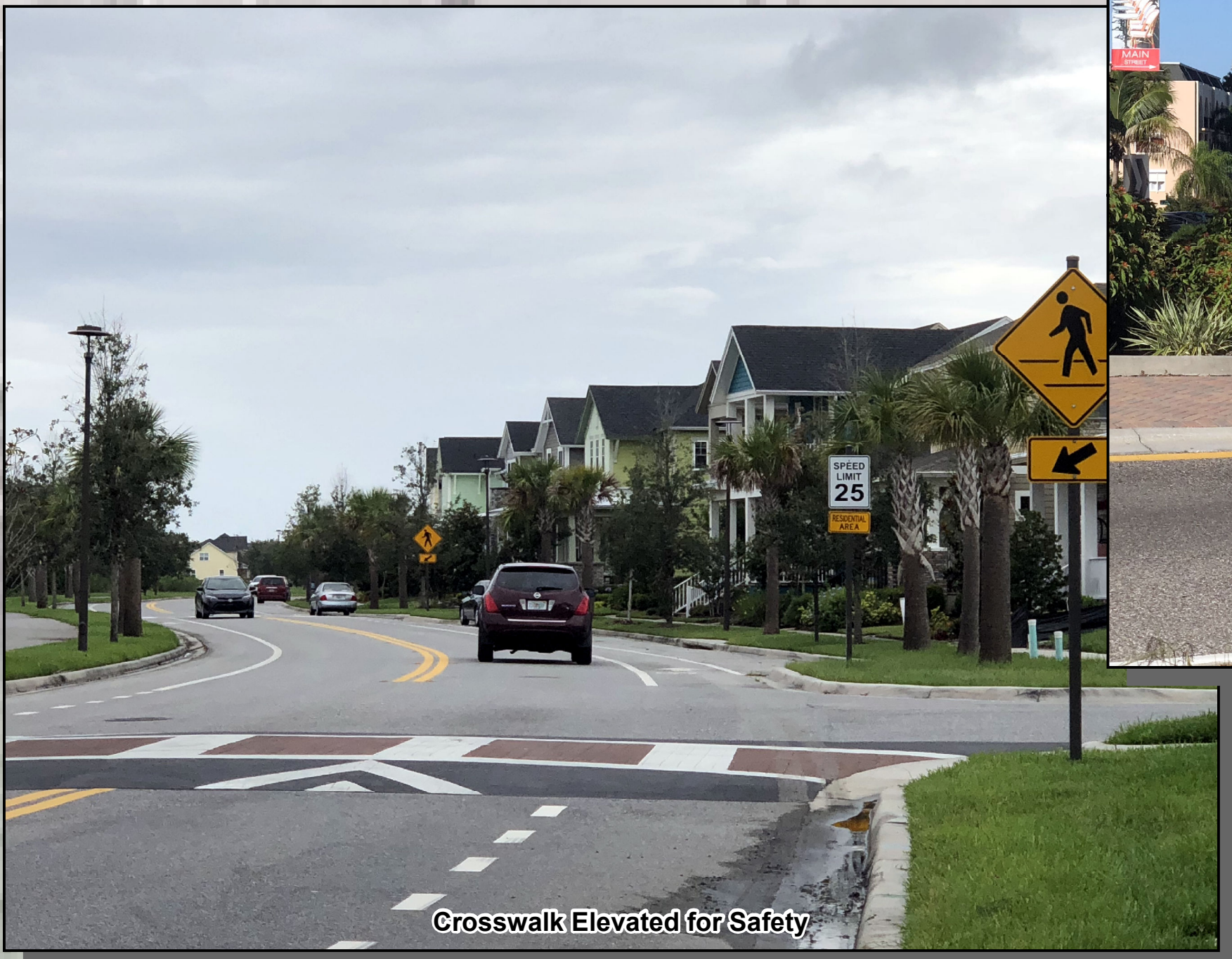
Crosswalk Elevated for Safety