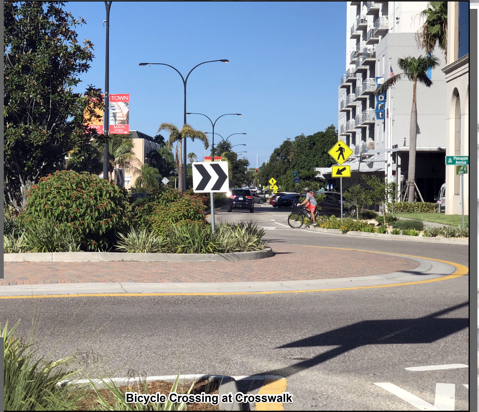
Bicycle Crossing at Crosswalk