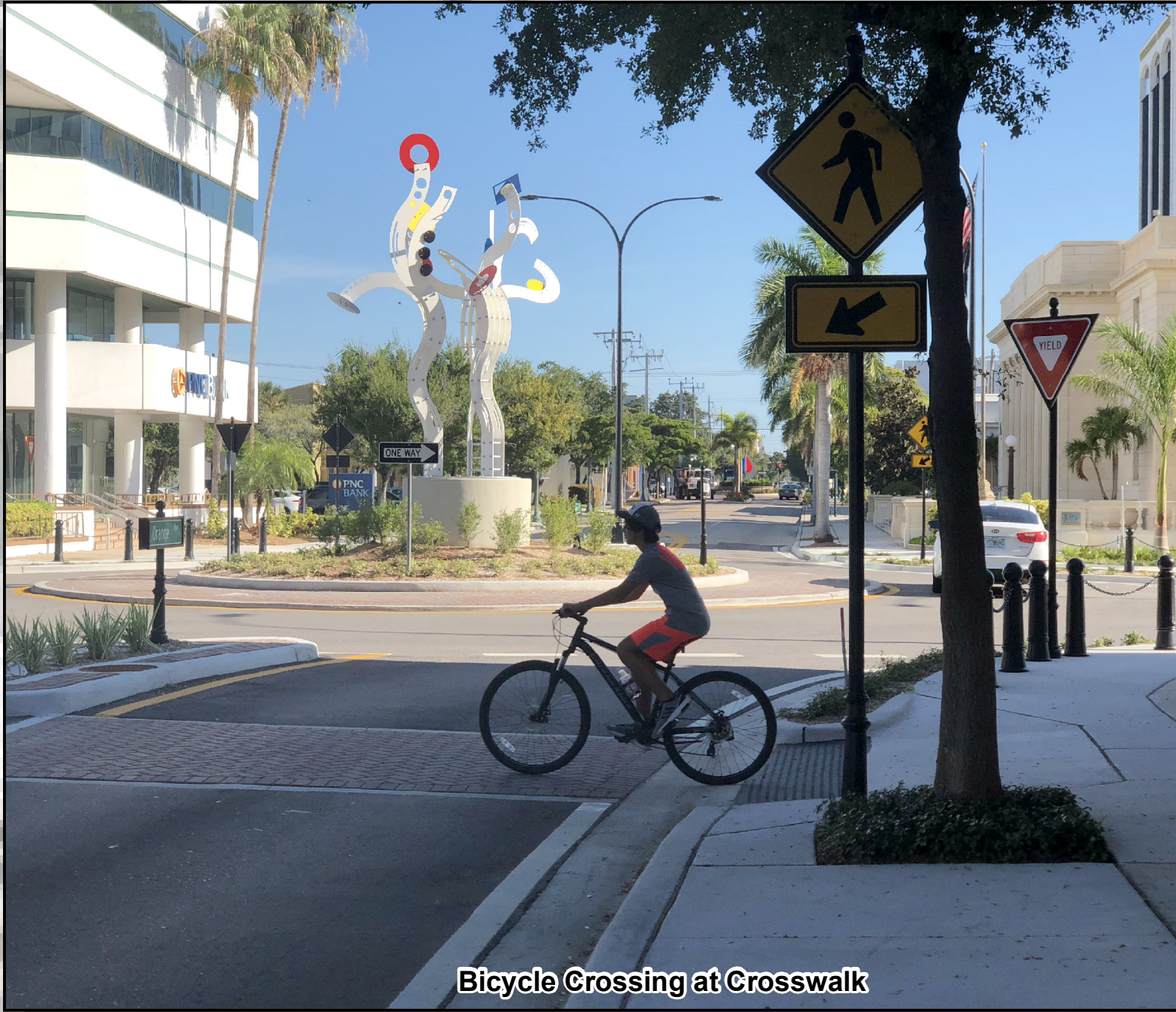
Bicycle Crossing at Crosswalk