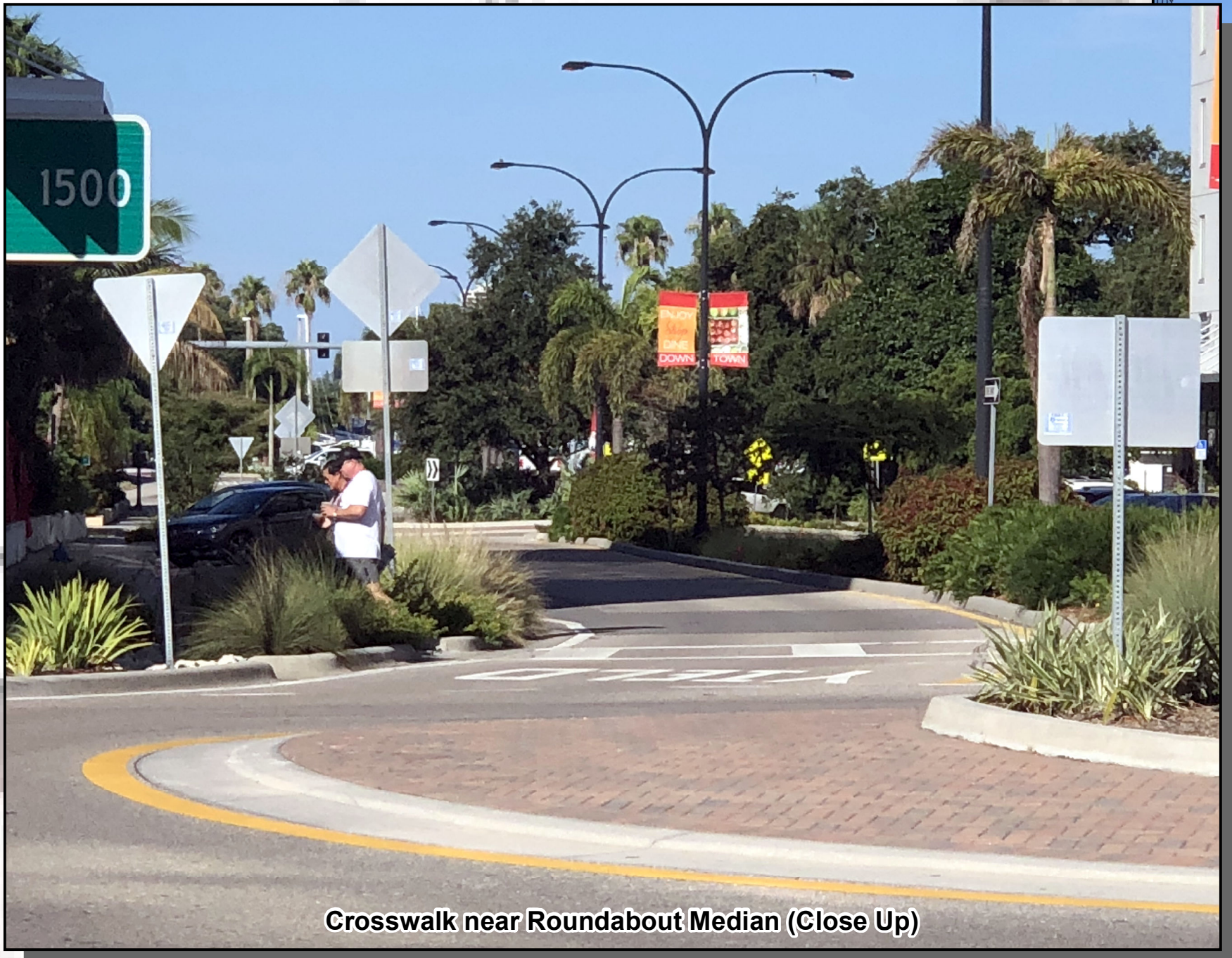
Crosswalk near Roundabout Median (Close Up)