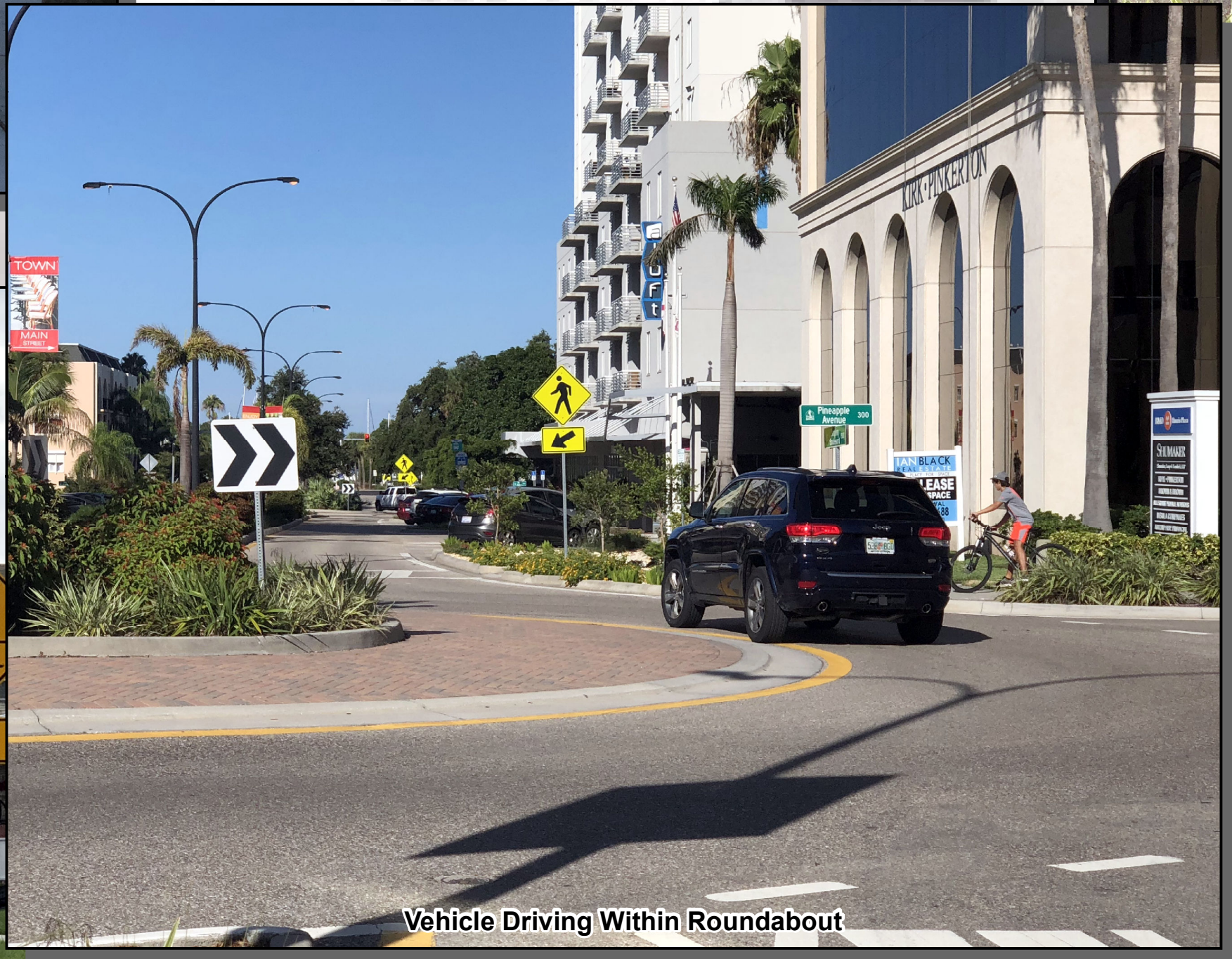
Vehicle Driving Within Roundabout