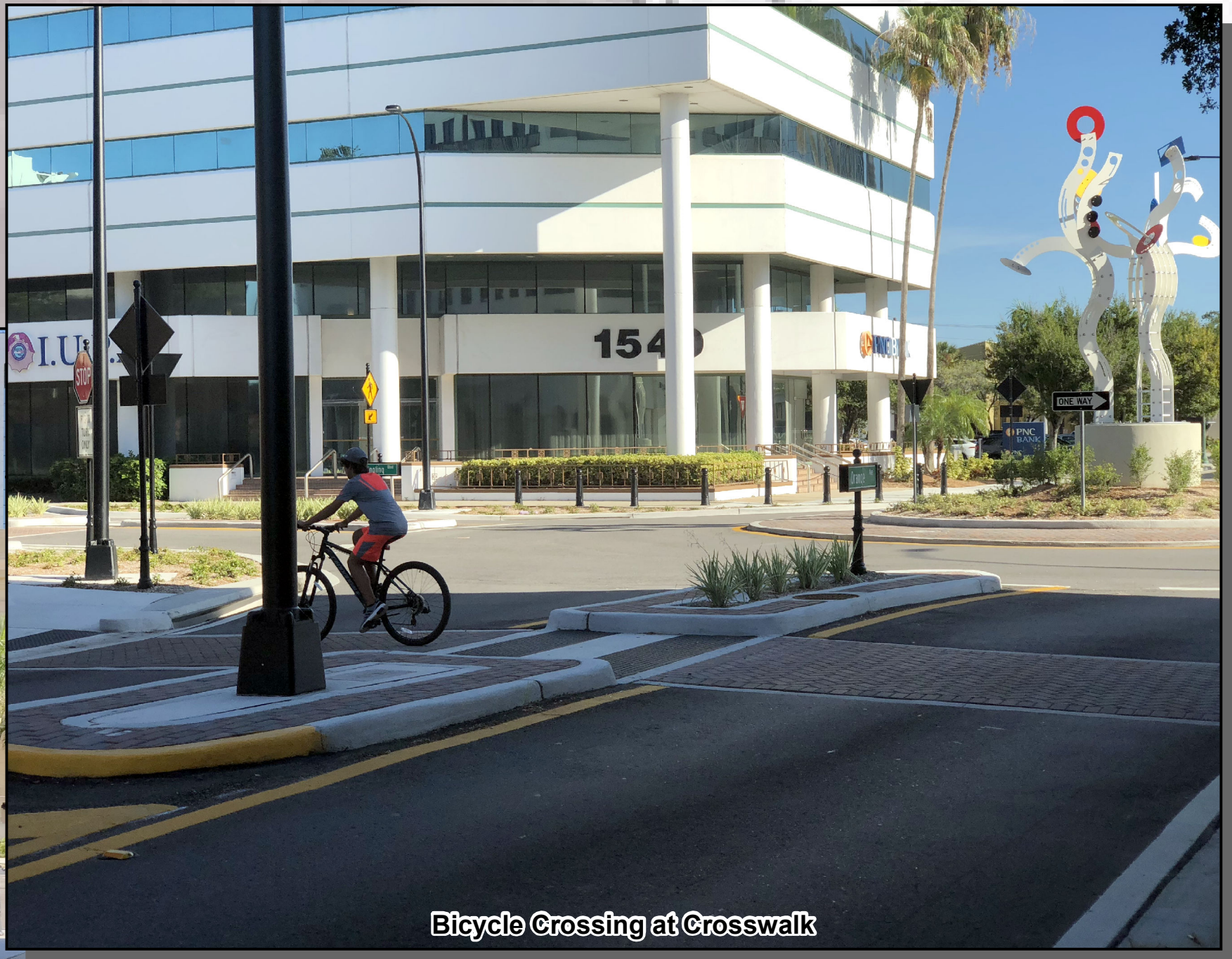
Bicycle Crossing at Crosswalk