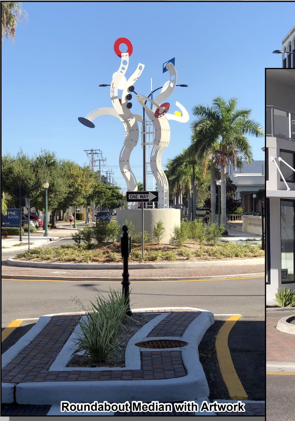
Roundabout Median with Artwork