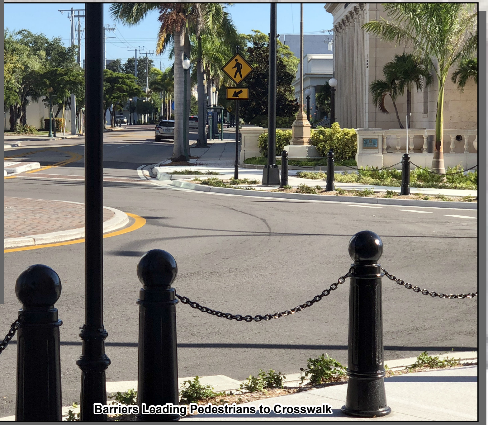
Barriers Leading Pedestrians to Crosswalk

Reference Base map comprised of Google Earth aerial imagery from 08/07/16. Not to Scale Providence Drawing No. 040-012-001-C181