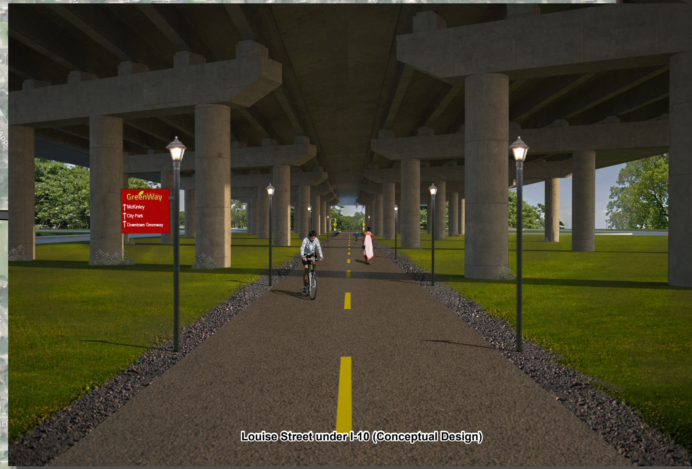
Louise Street under I-10 (Conceptual Design)