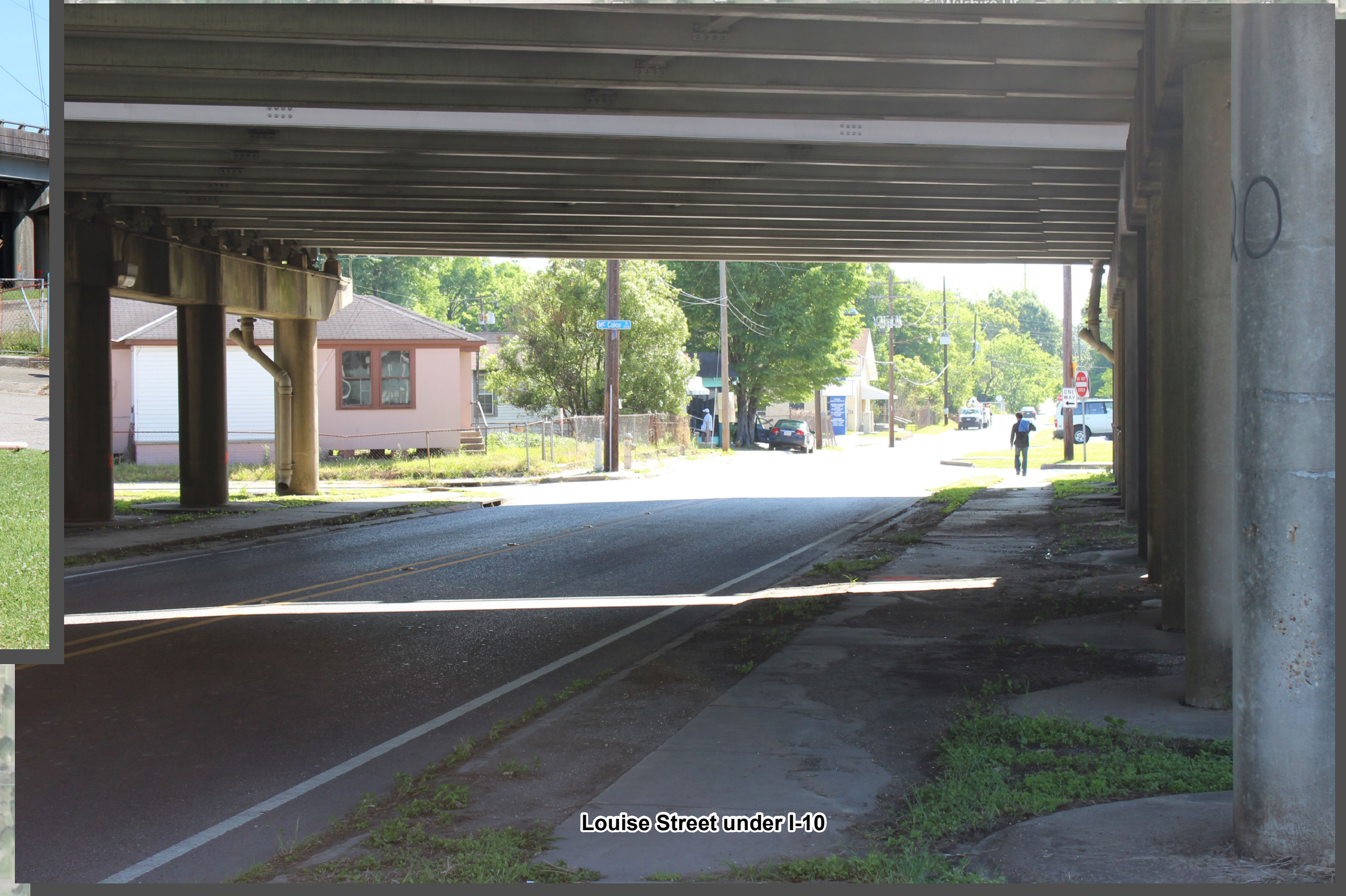
Louise Street under I-10