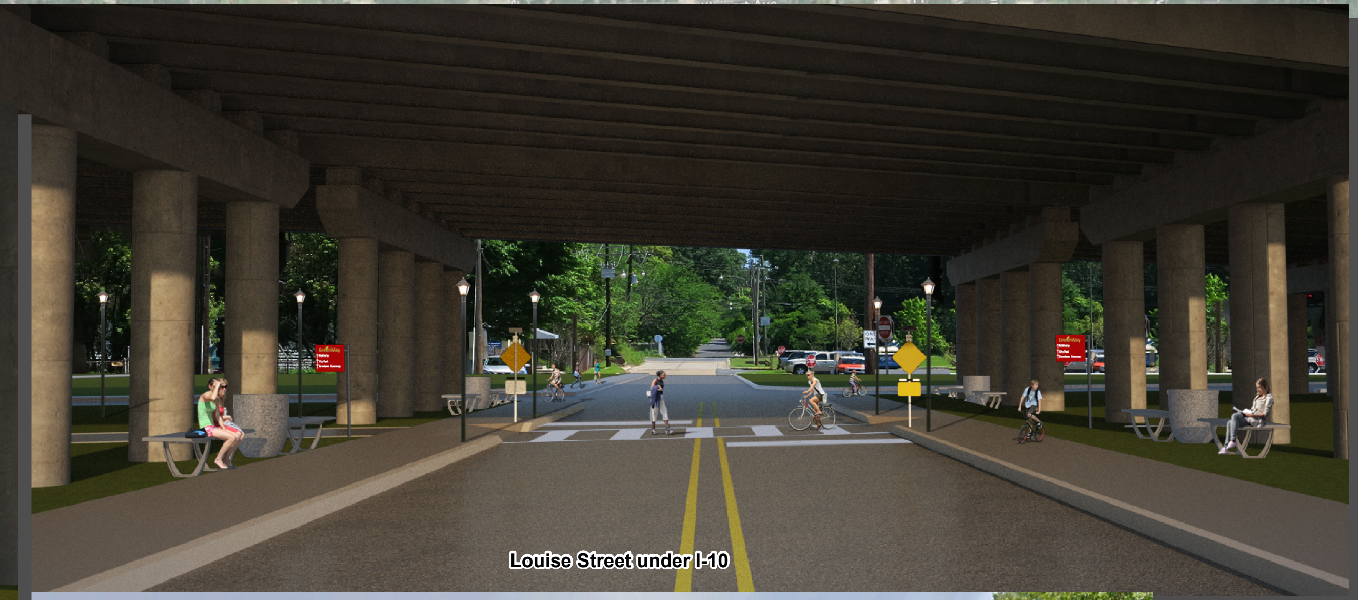
Louise Street under I-10