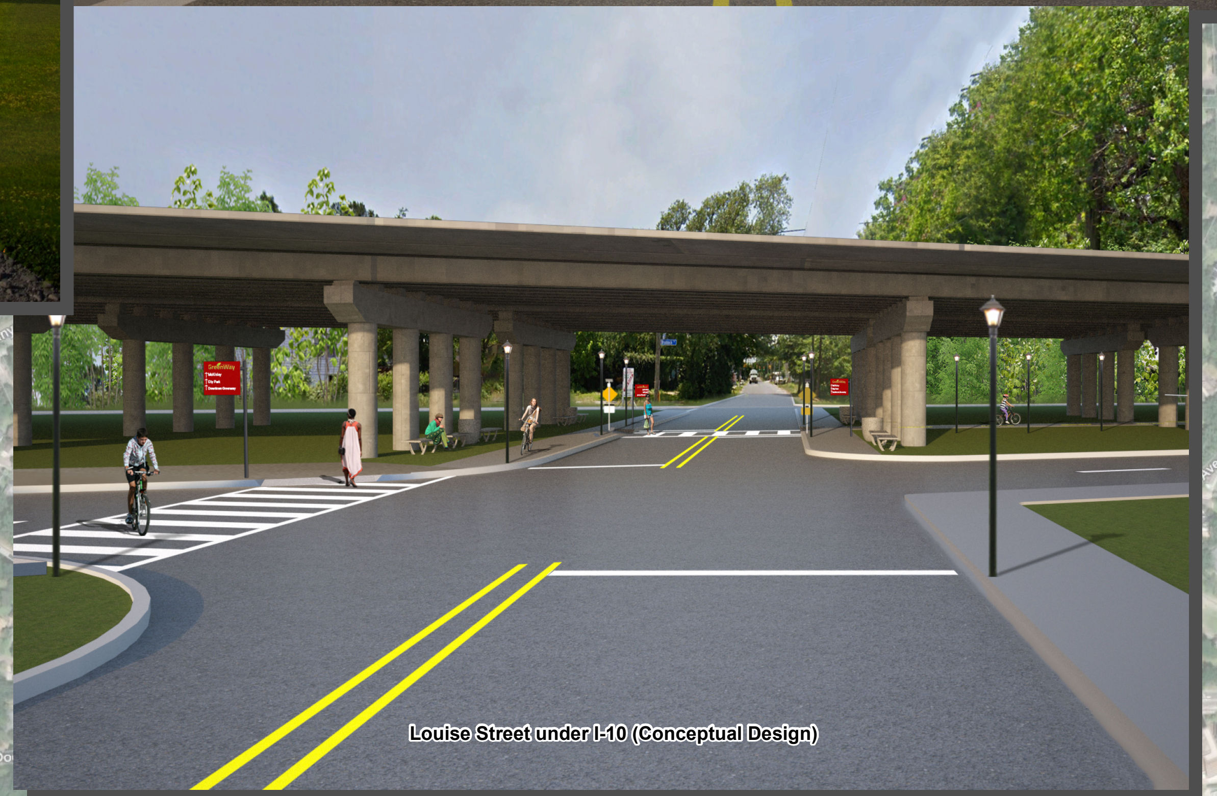
Louise Street under I-10 (Conceptual Design)