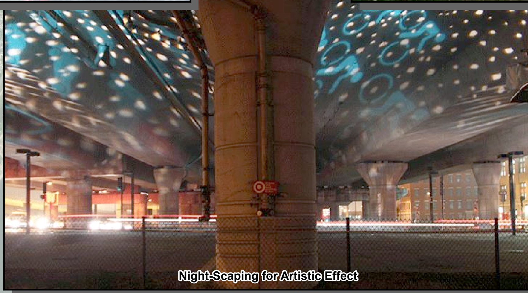
Night-Scaping for Artistic Effect