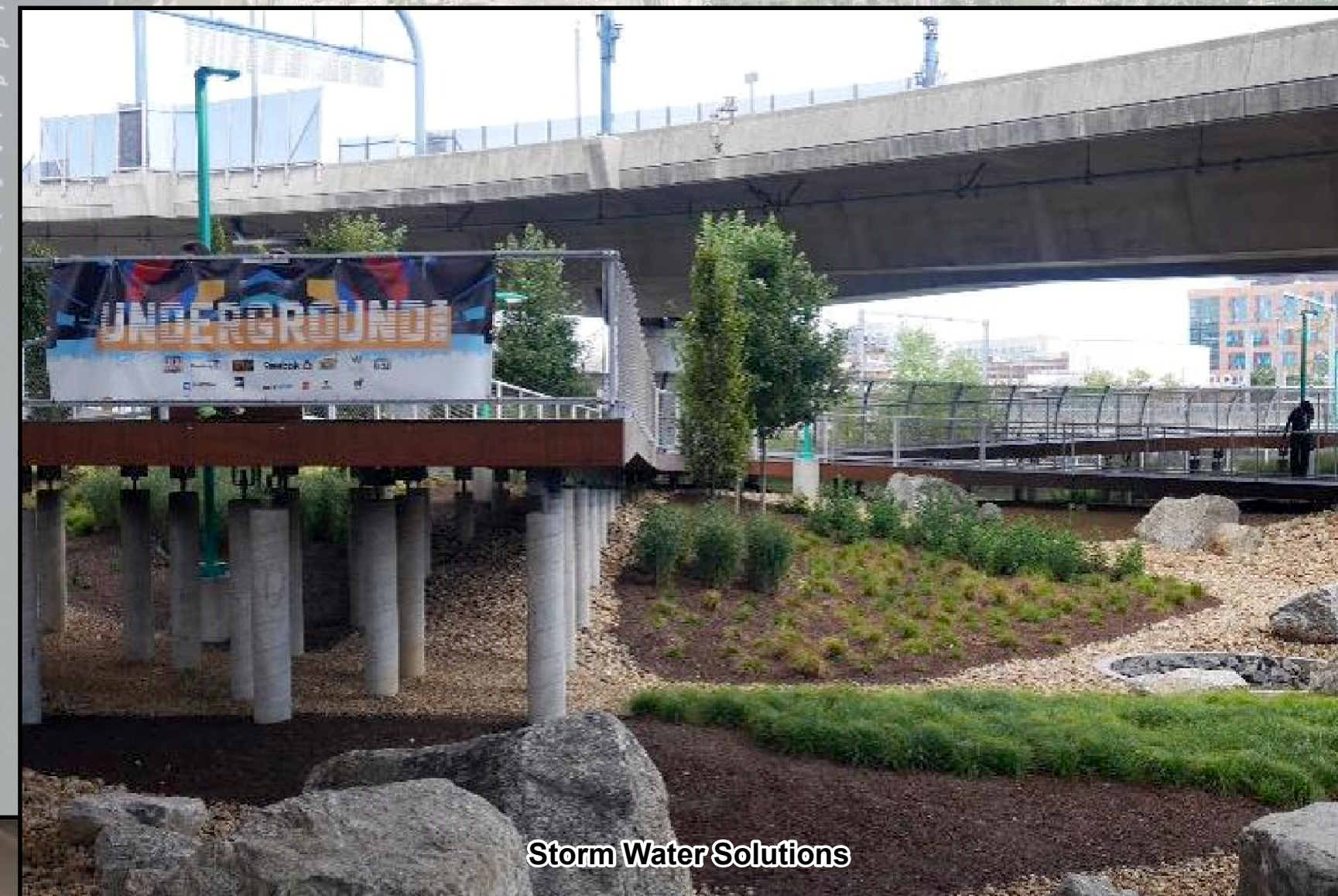
Storm Water Solutions