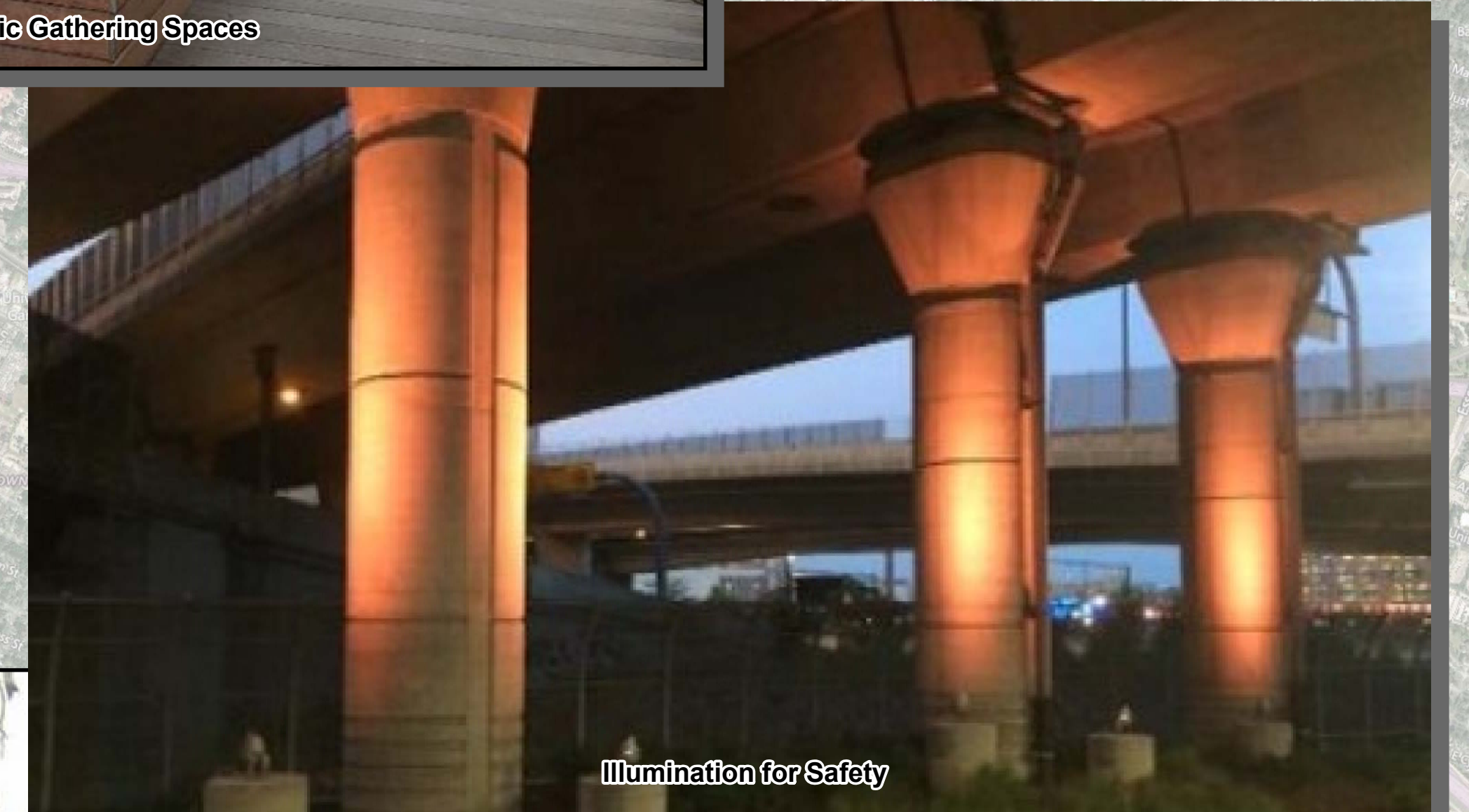
Illumination for Safety