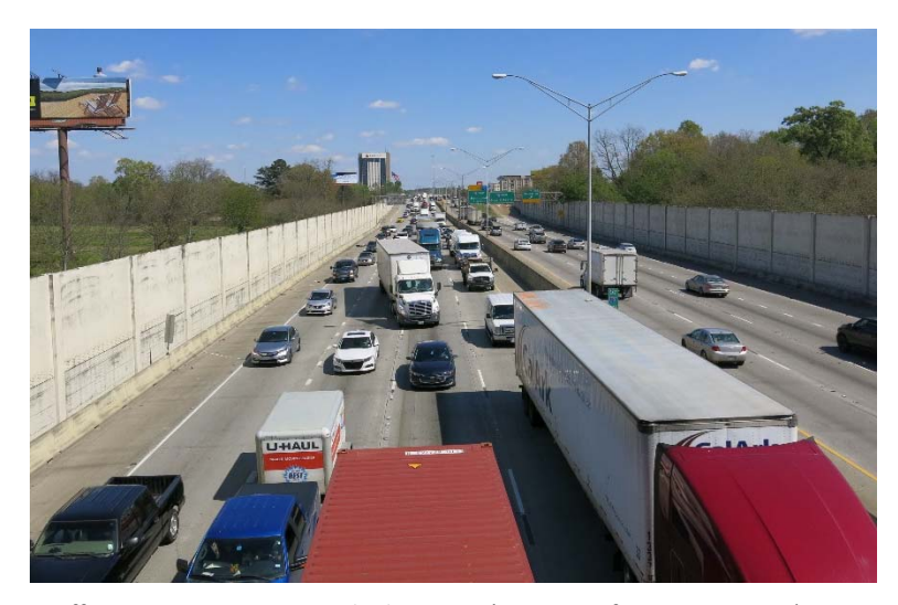
Traffic on I-10 at Nairn Drive, looking East

In addition to the elements of the project that will increase capacity on I-10, the Louisiana DOTD is exploring opportunities to include Community Connections elements into the project. There are five locations that the Louisiana DOTD believes would benefit from Community Connections investments: