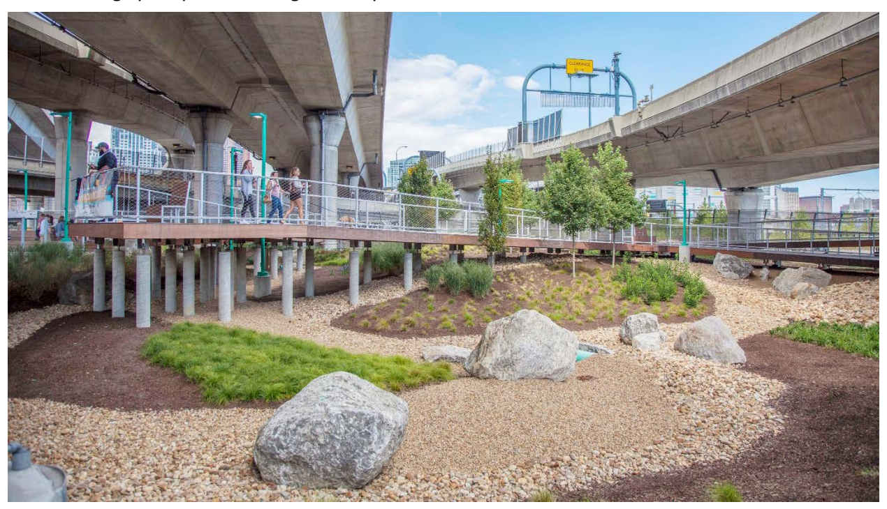
Underground at Ink Block

Two neighborhoods south of downtown Boston – the South End and South Boston – have long been separated by the Fort Point Channel and the Interstate 93 viaduct. The elevated highway, reconstructed as part of the Central Artery/Tunnel project decades ago, provided an unpleasant, if not hostile, environment for pedestrians. The lighting was dim, there was a perception of the presence of illegal activity, and it was a generally uncomfortable space. MassDOT previously used the space under the highway for construction staging and storage. MassDOT partnered with the developer of an adjacent set of parcels to reimagine the space under the highway as a safe, bright space for pedestrians, cyclists, and those seeking open space in a congested city.