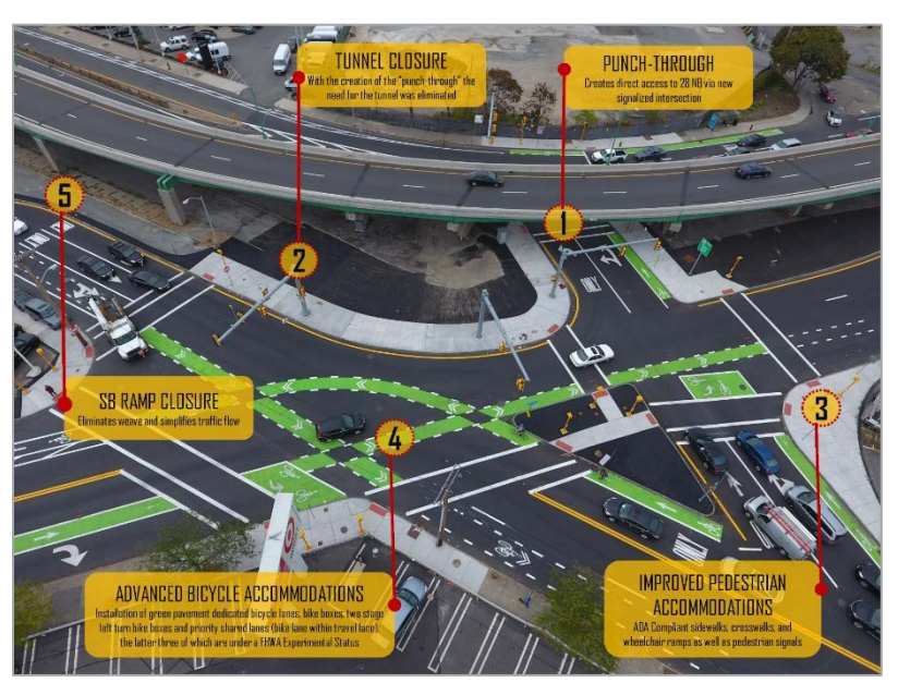
Improvements at the McCarthy Overpass and the intersection of Somerville Avenue and Medford Street.

The McGrath Highway (Route 28) in Somerville, MA runs between Mystic Avenue/I-93 to the north and the Monsignor O'Brien Highway at the Cambridge line to the south. The McCarthy Overpass is the elevated section, or "viaduct" which provides a significant link on the McGrath corridor. The Grounding McGrath Highway project seeks to reconnect Somerville by converting the elevated portion of the highway into a six-lane, atgrade boulevard. The project will also incorporate a separated bicycle path along the length of the corridor, as well as two new pedestrian crossings.