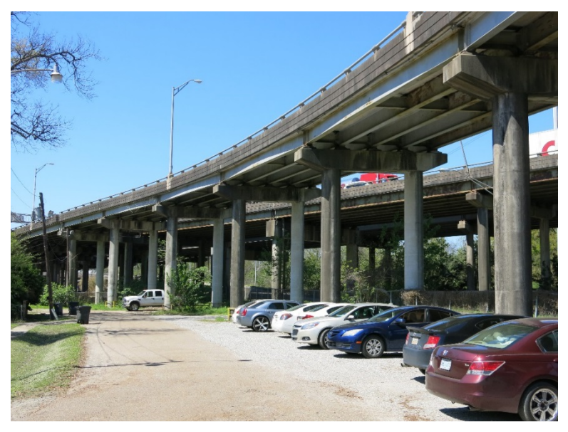
Parking adjacent to Perkins Road Ramps

As currently planned, the I-10 project involves removing the Perkins Road ramps, which would require vehicles