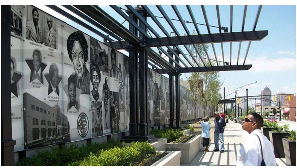
Cultural Wall on Long Street Bridge in Columbus, OH

ODOT conducted public engagement regarding the project and the phased construction schedule, as well as the overall project design. Public comments focused on the preservation of access in the redesign process, which would necessitate a lengthy consideration of designs. ODOT also presented a wide variety of design features for the projects, and asked for input. This exchange led to the selection of widened bridges designed to reconnect communities, which included green spaces, bicycle and pedestrian paths, along with the creation of the Long Street Bridge Cultural Wall with artwork displaying community history.