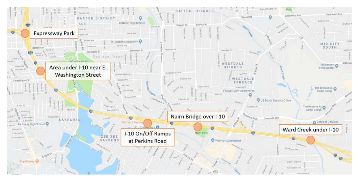
Map of I-10 Corridor and Locations Visited during the Tour