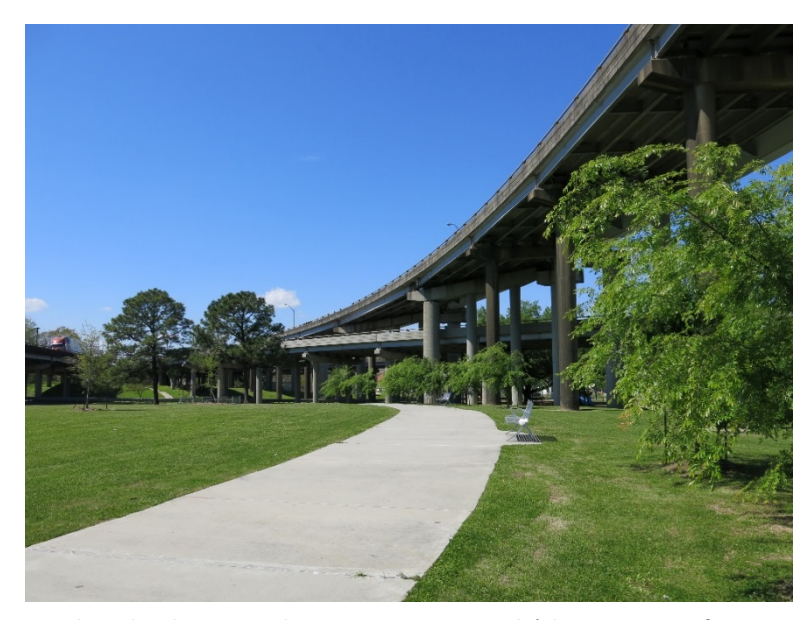
Bicycle and Pedestrian Pathway in Expressway Park

The group visited Expressway Park because it could serve as inspiration for future Community Connections elements and partnerships throughout the I-10 project corridor. Expressway Park was established shortly after I-10 was originally constructed. It is located immediately beneath the elevated highway ramps that connect I-10 to I-110 just south of downtown Baton Rouge. In 1970, Louisiana DOTD and BREC entered into a joint use agreement - Louisiana DOTD owns the park while BREC operates and maintains it.