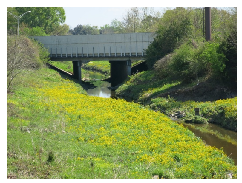
Ward Creek under I-10

Finally, the peer exchange participants visited Ward Creek as it passes under a bridge portion of I-10. The creek is located 0.9 miles east of the I-10 interchange at College Drive. It presents an opportunity for a possible bicycle and pedestrian path along the creek, passing under I-10. Currently, the distance between interchanges in this area (College Drive and Essen Lane) is 2.6 miles. Over this distance, I-10 serves as a barrier from traveling north-south. A possible path along Ward Creek would provide an important northsouth connection. However, due to the low clearance below the bridge