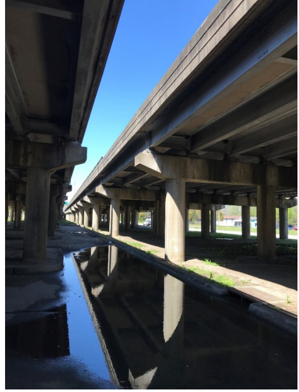
Area under I-10 near E. Washington Street

Next, the group visited space beneath I-10 between the East Washington Street ramps. The space beneath the highway is currently used for parking, particularly on Sundays due to the proximity of the location to a nearby church. This location is also adjacent to the McKinley Middle Magnet School.